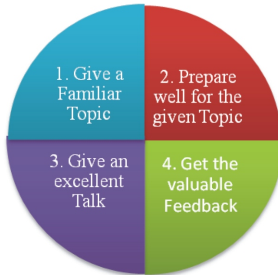
Fig: Steps involved in a JAM Session

JAM speech includes rich in vocabulary and variety in grammatical structure. The selection of topics depends upon the needs and interests of the learners and most of the topics are chosen from day-to-day life events or current topics.