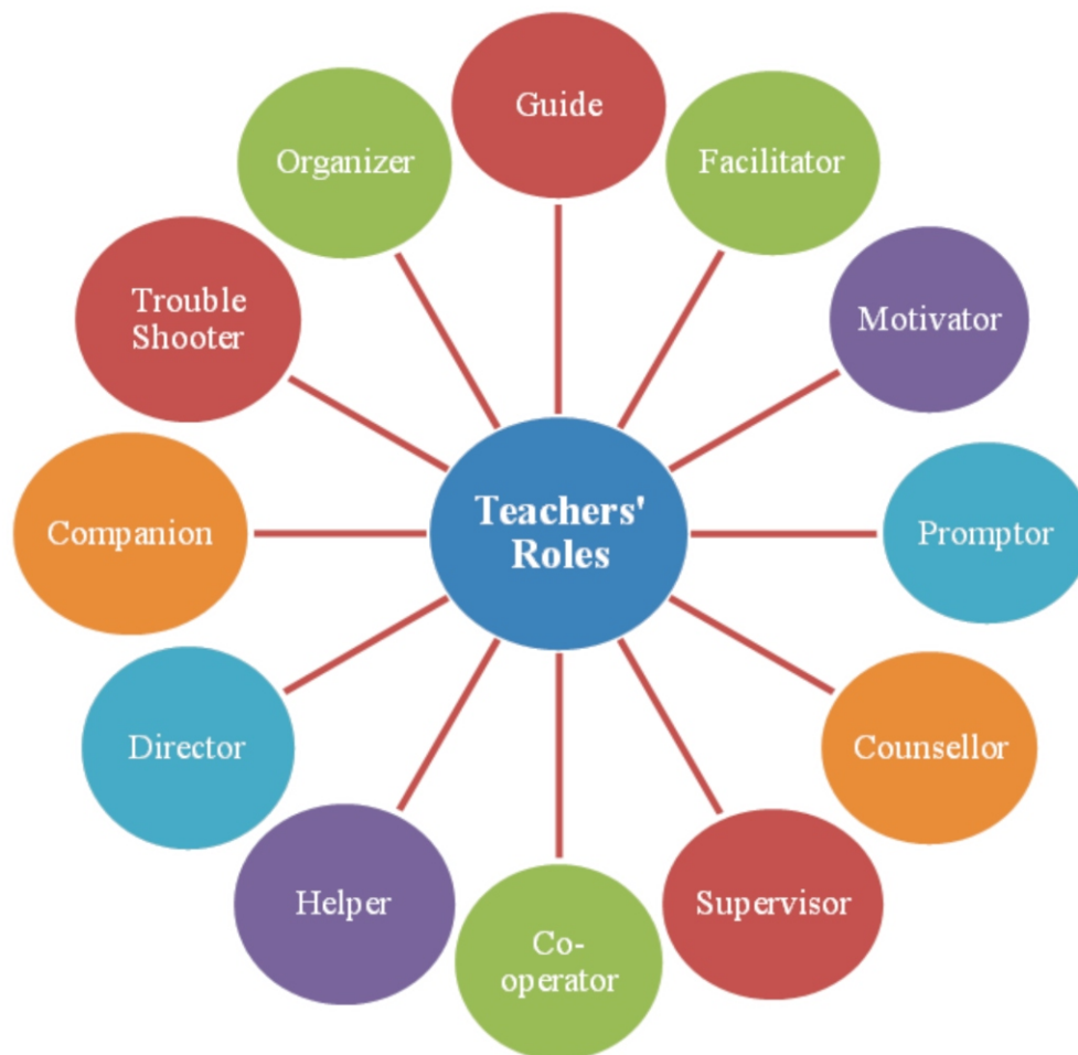
Fig: The Role of the Teachers during the JAM Sessions in the Modern English Classrooms

Furthermore, the learners should understand that the present critical complex system of getting through the several rounds of the interview and concentrate more on JAM sessions to improve their oral communication skills in the presence of their teachers in their EFL/ESL classrooms.