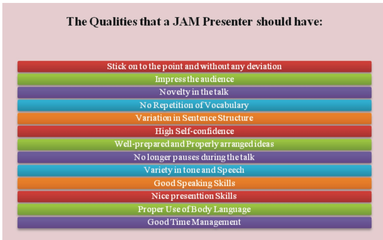
Fig: Qualities of the best JAM Presenter

to the speakers to prepare their speech. In this speech preparation process, the learners have to go through several resources to get suitable points for the talk. So the learners search for the relevant information and go through it very quickly by skimming the text. Later, the learners search for the specific or particular point that seems to be more relevant to the given topic and they scan the text thoroughly for this purpose. In this way, the learners develop their skimming and scanning skills from these JAM sessions to get the relevant details to prepare for their speech.