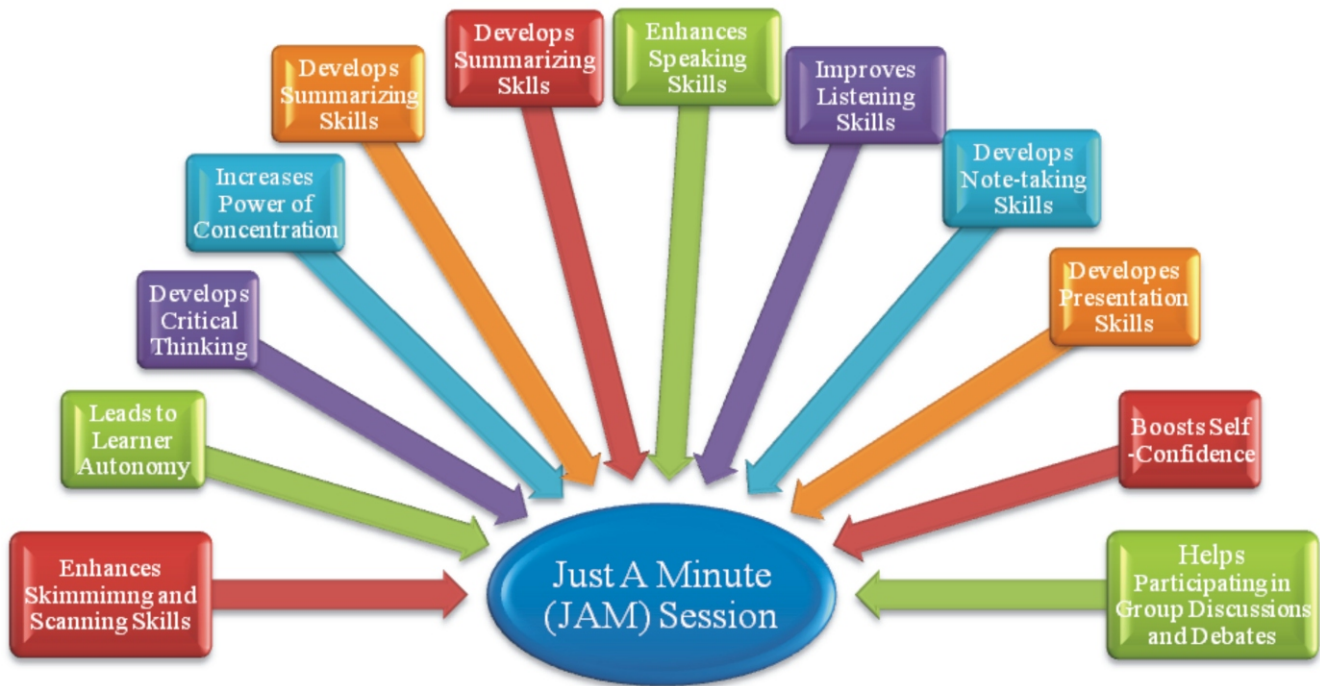
Fig: Benefits or Advantages of a JAM Session

and the listeners really appreciate that talk. The listeners are greatly impressed by the talk that is well-organized and well-prepared and then they also try to give such flawless speeches. This kind of encouragement develops the confidence levels of the speakers so that they can also prepare their speeches without any drawback and try to impress the listeners.